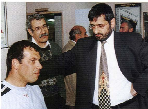
The Institute proudly hosted Eli Yishai, Israel's Minister of Labor and Social Affairs in March. Accompanied by the Director General and other members of his staff, the visit was very informative and demonstrated many different facets of the JIB. Yishai is shown here with blind athlete at Institute's Sport Center.