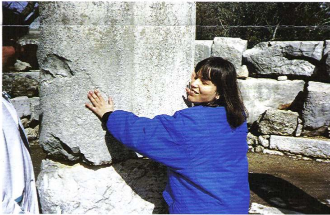
Feeling the layers of history on a spring outing

Today the modern state-of-the-art atmosphere of the Institute is a far cry from its humble beginnings almost a century ago. Throughout the 20th century the goals of the Institute have not greatly changed. In 1996, as in the early 1900's, the Jewish Institute for the Blind is still dedicated to helping the blind to help themselves.